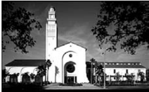
The former Beverly Hills Water Treatment Plant No. 1, restored as the Fairbanks Center for Film Study of the Academy of Motion Picture Arts & Sciences.