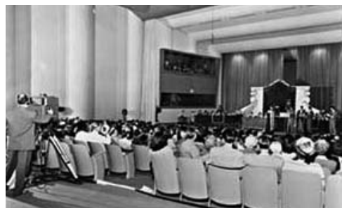
Studio 4 at the Pickford Center for Motion Picture Study, July 7, 1948, during a taping of "Queen for a Day," the Don Lee Broadcasting Company's most popular show.