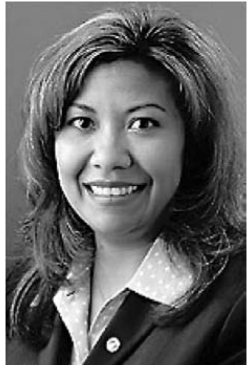
Pomona's new mayor, Norma Torres

We of Pomona Heritage look forward to working with the new Mayor in the future in making Pomona's historic resources an important part of the revitalization of the city. We also wish her luck as mayor in working with the diverse community that is the city of Pomona, she has some big shoes to fill.