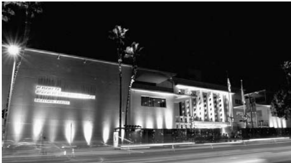
The restored Academy of Motion Picture Arts and Sciences' Pickford Center for Motion Picture Study on Vine St. in Hollywood.

In 2002, Fran began work on the renovation of the 120,000 sq. ft. Don Lee-Mutual Broadcasting building on Vine Street in Hollywood as the Academy's Pickford Center. The