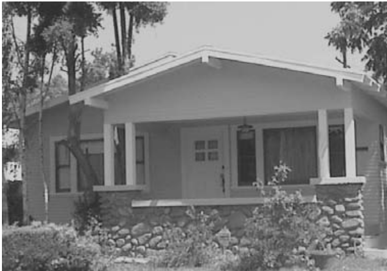
Bungalows such as this have been demolished in recent months to make room for various re-development and school district projects. While not saving the structures, a historic building survey would at least preserve the information regarding the home's history and architecture for future researchers into Pomona's past