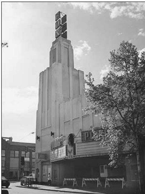
The Fox as it looks today with a generator parked in its forecourt and a black smudge on the marquee due to generator exhaust

In mid April, the theater experienced an electrical fire in the basement which knocked out the power to the entire building. This not only affected the Fox Theater, but the El Merandero Bakery and Restaurant, tenants in the retail space outside the theater, were also left powerless. The city, El Merandero's landlords, quickly installed a generator in the forecourt of the theater to provide the necessary "juice" so El Merandero can operate.