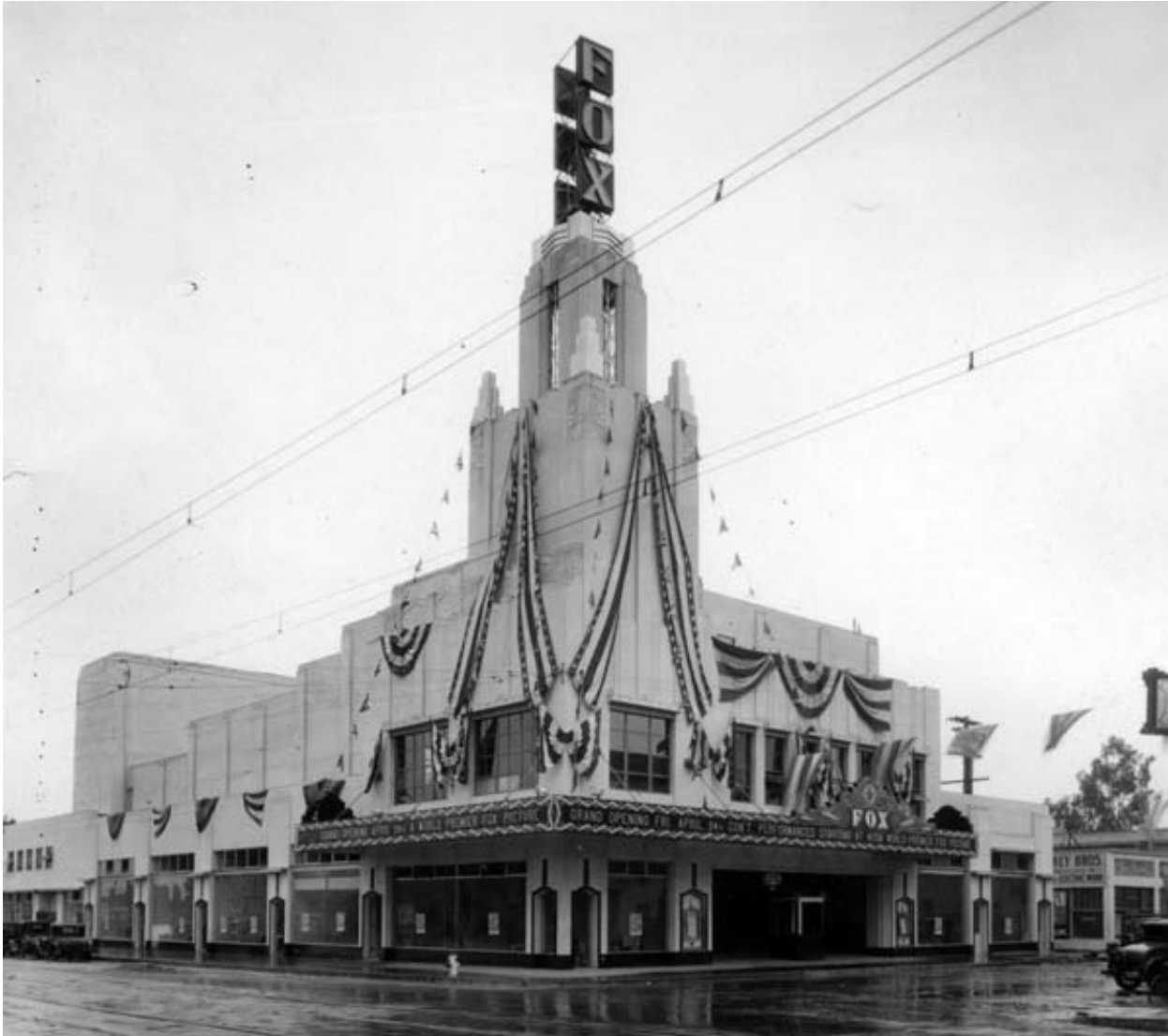
Pomona's Fox Theater dressed up with bunting for its grand opening on April 24, 1931 on a wet spring day.